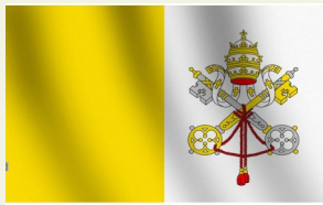
The Pope's flag.