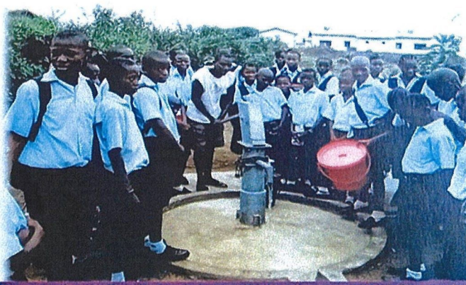
Our mission in Bo, Sierra Leone – Water for our school & everyone

Spiritan projects we fund are covered within the following categories: Education, Evangelization / Pastoral Care, Famine / Drought Relief, Healthcare / Water Security / Sanitation, Refugee Services and Seminary Formation etc.