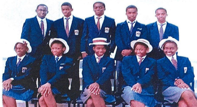
STUDENTS - Bishop Okoye Spiritan Secondary School, PH, Nigeria