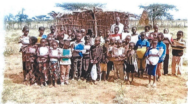
Pupils in front of their Classroom in our Mission in Qottle, Ethiopia